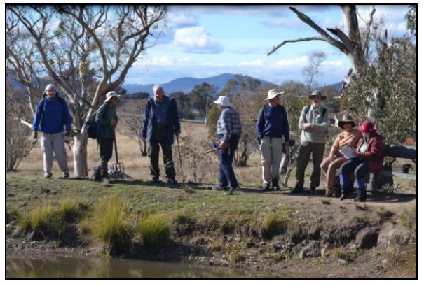
Typical Committee Meeting, 19<sup>th</sup> July.

we need new office-bearers and must train other members in the administrative tasks.